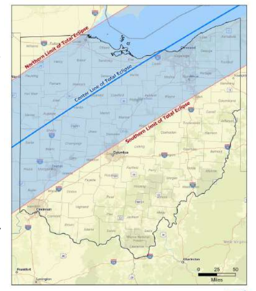
Total Solar Eclipse Path through Ohio April 8, 2024

Solar eclipses occur when the moon casts its shadow on the Earth as it passes between the Earth and the Sun. A total solar eclipse occurs when the moon appears to totally obscure the Sun. According to the Ohio Emergency Management Agency, the next total solar eclipse that can be seen from the contiguous United States will be on August 23, 2044. Go to ema.ohio.gov for more information.