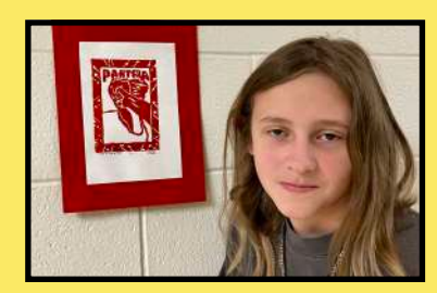
▲ Max Sheets, Linoleum Print