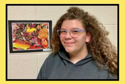
🔺 Keira Myers, Google Drawing