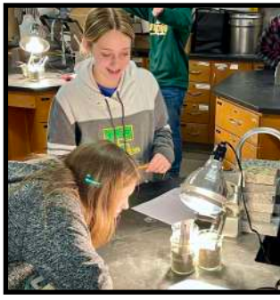
▲ Seventh graders learning about local winds while calculating heating and cooling rates of different land materials.