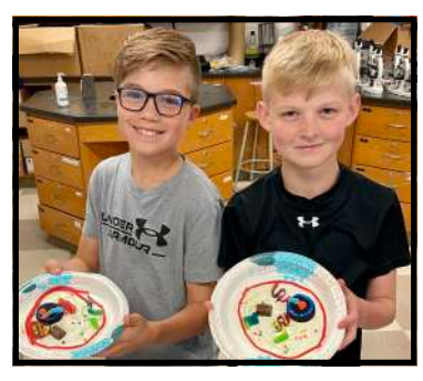
▲ Sixth graders create edible cells to show their knowledge of organelles and their functions.