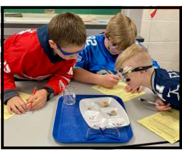
▲ Sixth graders determining which rocks contain the mineral calcite.