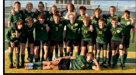
▲ Boys soccer team, Sectional Champs!