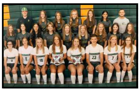
△ Girls soccer team, NWOAL Champs!