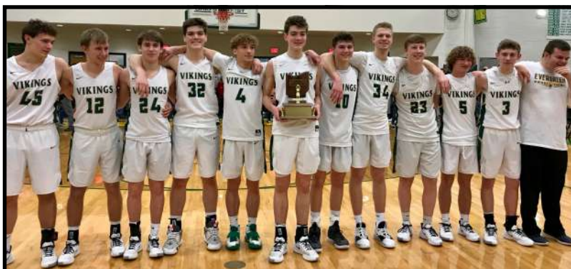
◀ Congrats boys varsity basketball team on earning NWOAL, Division III Sectional & District titles!