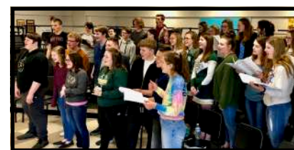
▲ Cast rehearsing for The Addams Family