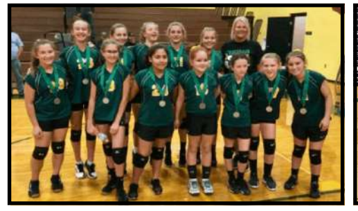
EMS 7th Grade Vollevball Team

EMS recently hosted the JoeZ-MoJack Classic Volleyball Tournament. Seven teams competed in each of the 7th and 8th grade contests. Participating teams included Swanton, Fassett A & B, Otsego, Ottawa Hills, Fairview, and Evergreen. After a full day of competition, both the EMS 7th grade and 8th grade teams were awarded second place in the tournament. Congratulations!