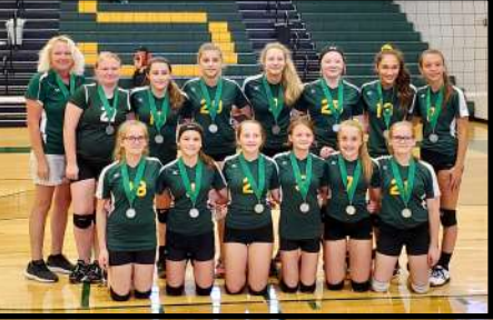
🔺 EMS 8th Grade Volleyball Team